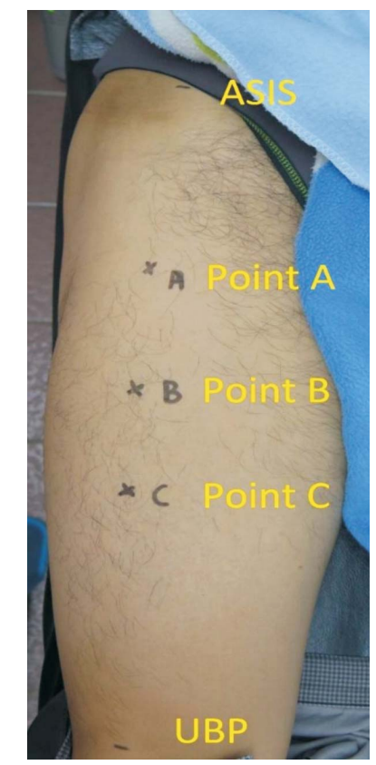
Figure 1. Anatomic reference points used for measurement of QMLT. A: Junction between upper 1/3 and lower2/3 of the distance between the anterior superior iliac spine and upper border of patella. B: Junction at the midpoint of the distance between the anterior superior iliac spine and upper border of patella. C: Junction between upper 2/3 and lower 1/3 of the distance between the anterior superior iliac spine and upper border of patella. ASIS: anterior superior iliac spine; QMLT: quadriceps muscle layer thickness; UBP: upper border of patella.

At all points, mean QMLT taken on the right was similar to measurements on the left (p > 0.05) (Table 1). Patients with malnutrition showed a trend towards a lower mean QMLT measure at all points compared to well-nourished patients (Table 2). Comparing the three points used to measure QMLT, Point A bilaterally and Point C on the left showed a significant difference (p < 0.05). The QMLT measures at